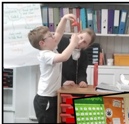
Exploring magnetic fields.

The children have also been continuing their work on forces and magnets in Science and have conducted investigations into the strength of different magnets whilst also experiencing the 'magic' of the magnetic field to make objects 'float' in mid-air!