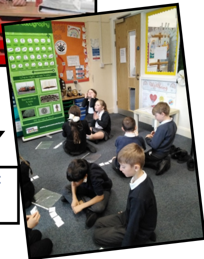
Enjoying the Islamic workshop.