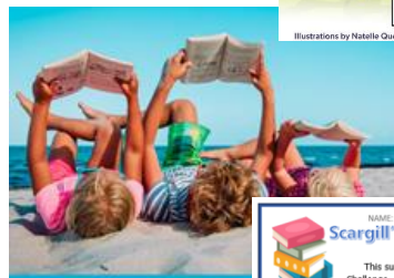
Summer Reading Booklist A booklist for EYFS, KS1 & KS2 pupils

Click the link here to view a Summer Reading Booklist from BookSpace for some book suggestions for children from EYFS up to Y6 along with some top tips to keep children reading over the holidays.