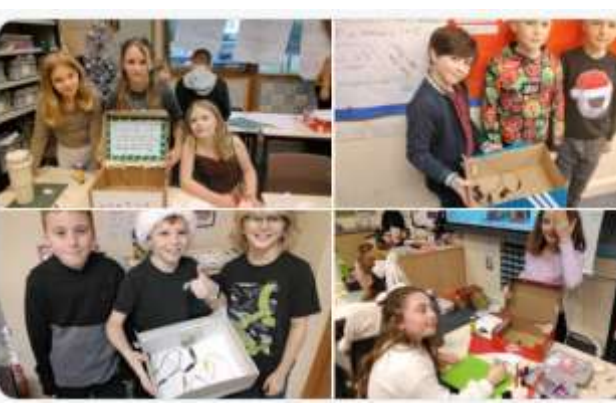
Building circuits in Science

Here are some pictures of what we've been up to over the past half term.