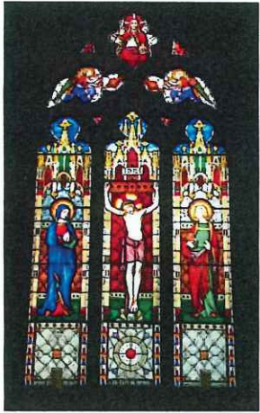
St Wilfrid's East Window

Many of these are highlighted in children's artwork to be seen at the church