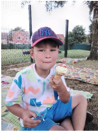
Ice cream time