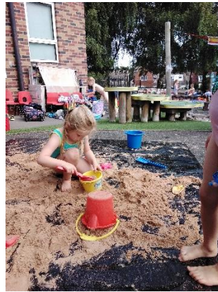
Lots of fun at the beach with friends.