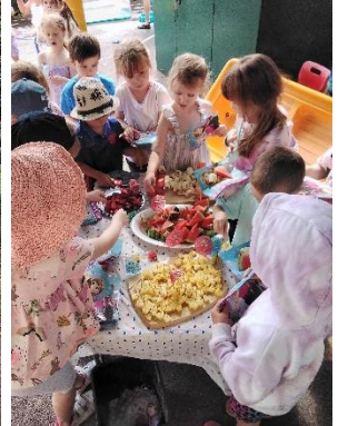
Fruit snack shack